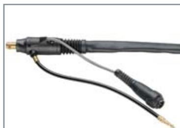
Cable connector for aircooled TIG 101/201 welding hose.