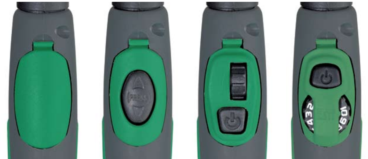
80300102 Blank cover. For use with e.g. foot switch.

* All Navigator and Commander MK III as of 1996.