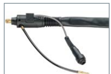
Cable connector for aircooled TIG 221 welding hose.