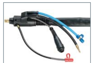
cable connector for watercooled TIG 301 welding hose.