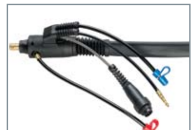
Cable connector for watercooled TIG 321/401/451 welding hose.

The Migatronic TIG ERGO range has been developed for two optional control units: a keypad unit or a unit with both keypad and control knob that allows communication of current control directly from the torch handle to the welding machine. You make the choice upon purchase of the welding hose but the unit is easily replaced later.