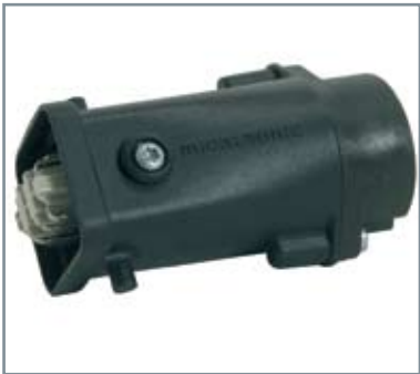
7/6 pole adaptor, 80300116

As standard the control unit consists of a keypad unit but for use on Migatron TIG machines, we recommend a control unit with both keypad unit and control knob.