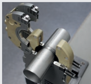
/ Perfect welds due to closed chamber