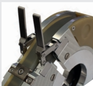
/ Spring loaded clamping system