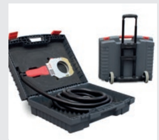
/ Transport case with trolley