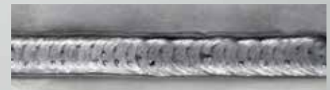
DUO Plus™ - Stainless steel

DUO Plus™ optimally preserves the strength of the steel and provides a TIG-like weld appearance.