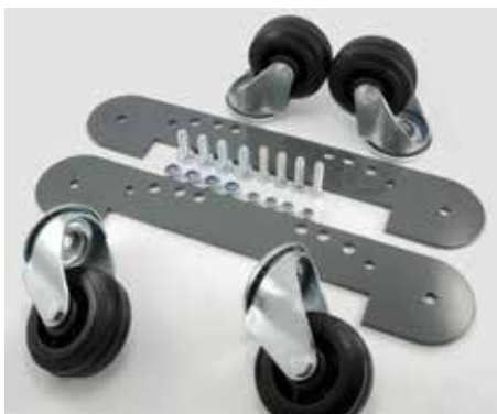
Set of wheels for mounting under protective frame (item number 78861413)