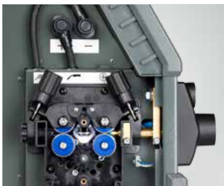
LED light in wire console (item number 78861545)