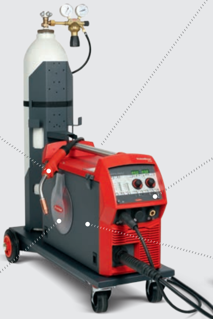
TRANSSTEEL 2500 COMPACT