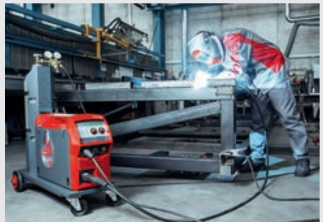
/ TransSteel 2500 Compact – the space-saving, powerful alternative for workshop operations