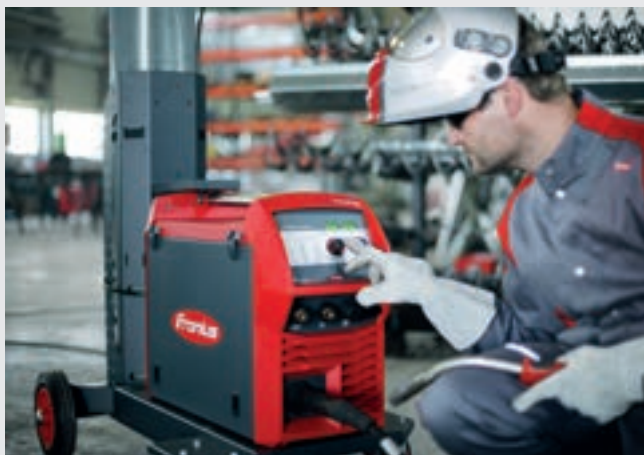
/ Very easy to operate, digitally controlled, with 'on-board' expert knowledge